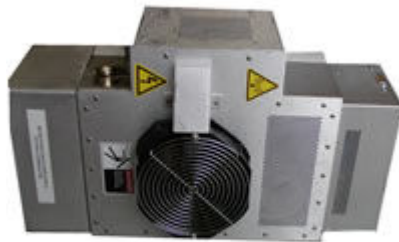
Match Multifunction ADPTR