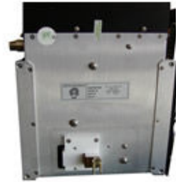
High Efficiency RF Match